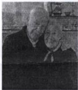
The loving couple in 1943.